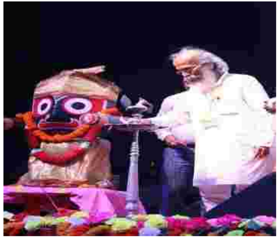
Sri Pratap Chandra Sarangi, Hon'ble Union Minister of state for MSMEs and Animal Husbandry, Dairying and Fisheries, Government of India lighting inaugural lamp.