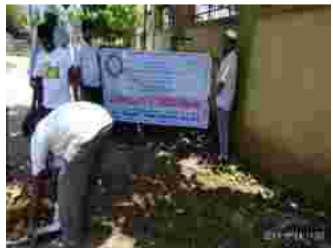
Swachhta pakhwada and cleanliness drive is being done at MSME-DI Branch office Rayagada.