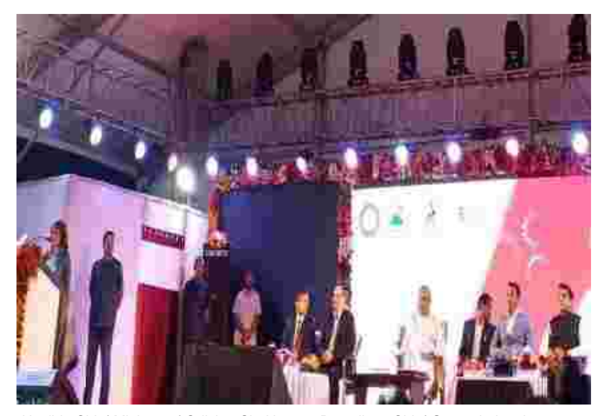
Hon'ble Chief Minister of Odisha, Sh. Naveen Patnaik as Chief Guest during the event.

MSME-DI, Cuttack had participated in Odisha MSME International Trade Fair - 2019 organised by Department of MSME, Govt of Odisha, Directorate of Export Promotion and Marketing, Govt of Odisha, and Odisha Small Industries Corporation, Cuttack held at IDCO Exhibition Ground, Bhubaneswar from 8.1.2020 to 12.01.2020. This event was sponsored by Office of DC(MSME). The Programme was inaugurated by Hon'ble Chief Minister of Odisha in the presence of Hon'ble Minister of MSME, Govt. of Odisha, Principal Secretary, MSME Department, Govt. of Odisha, Director of Industries, Govt. of Odisha, Chairman, Odisha Small Industries Corporation, (OSIC) and Director of Export Promotion and Management and others. Dr. S.K. Sahoo, Director In-Charge, MSME-DI, Cuttack attended the valedictory event of the MSME Trade Fair and addressed the gathering. About 500 MSMEs participated in the Odisha MSME International Trade Fair.