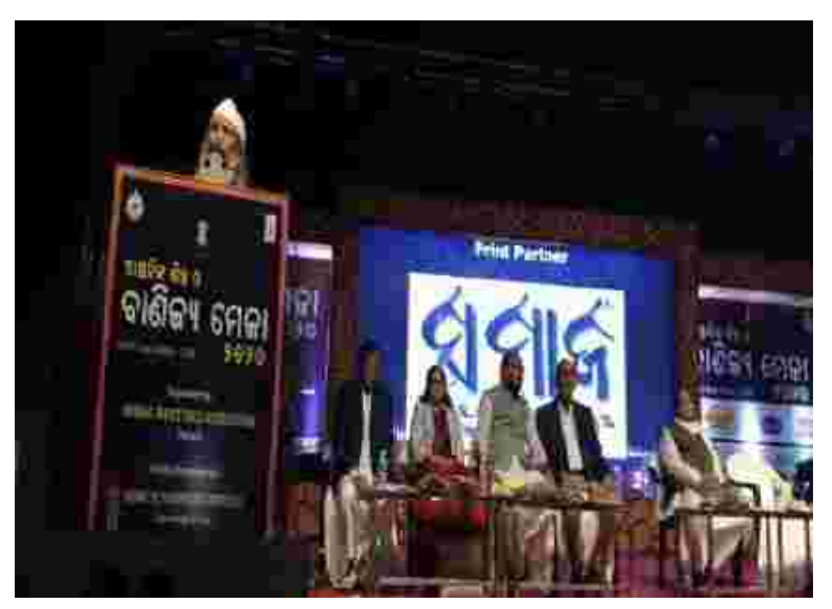
Sri Pratap Chandra Sarangi, Hon'ble Union Minister of state for MSMEs and Animal Husbandry, Dairying and Fisheries, Government of India addressing participants.

All the days' dignitaries visited several stalls to encourage the entrepreneurs. There were cultural programs by eminent artist & groups of the States & also of the other States every evening. The media both print & electronic very nicely covered the program nicely including interviews of exhibitors and organizers.