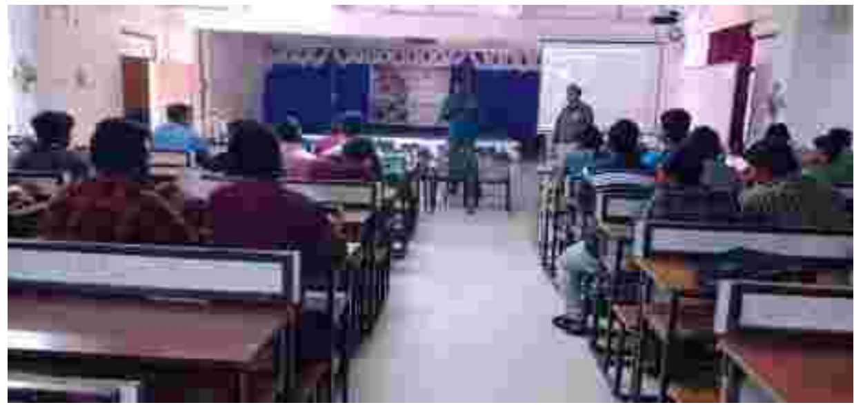
NATIONAL LEVEL AWARENESS PROGRAMME CONDUCTED BY BRANCH MSME-DI, RAYGADA AT KORAPUT

Branch MSME-DI, Rayagada organized National Level Awareness Programme(NLAP) at Government College of Engineering, Kalahandi, Bhawanipatna on 02-3-2020. Total 105 students attended the programme.