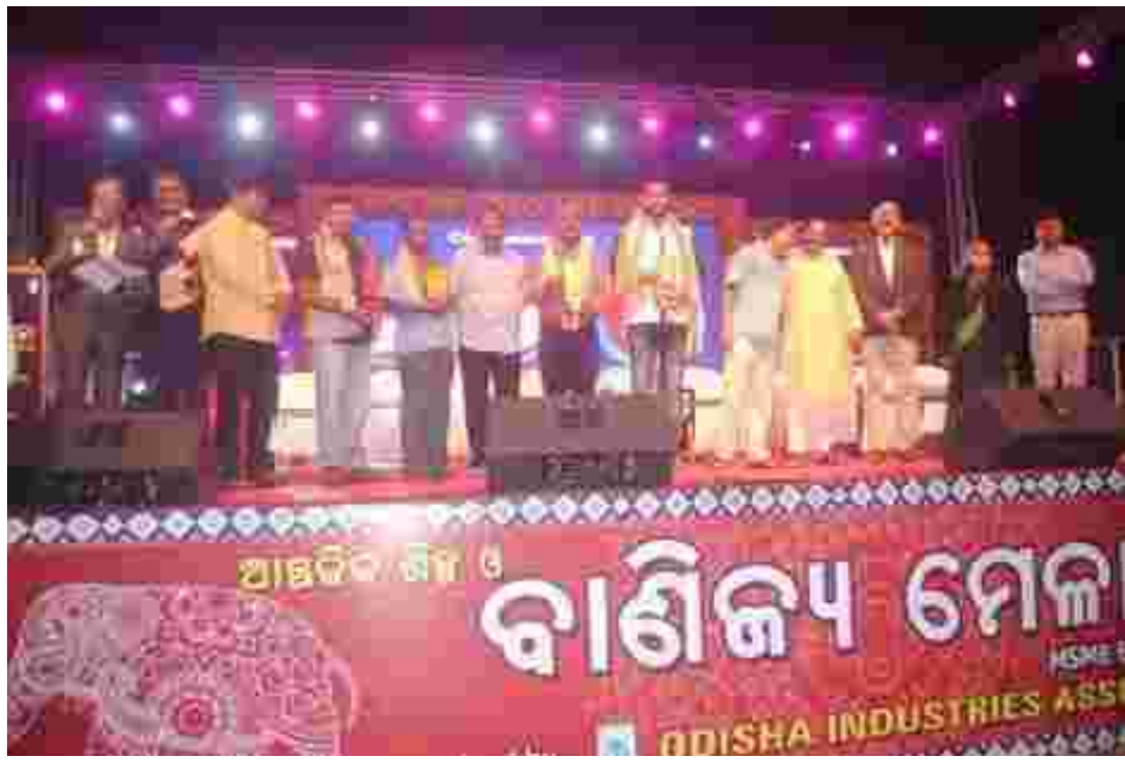
Award Distribution to Outstanding MSMEs participated in the event.