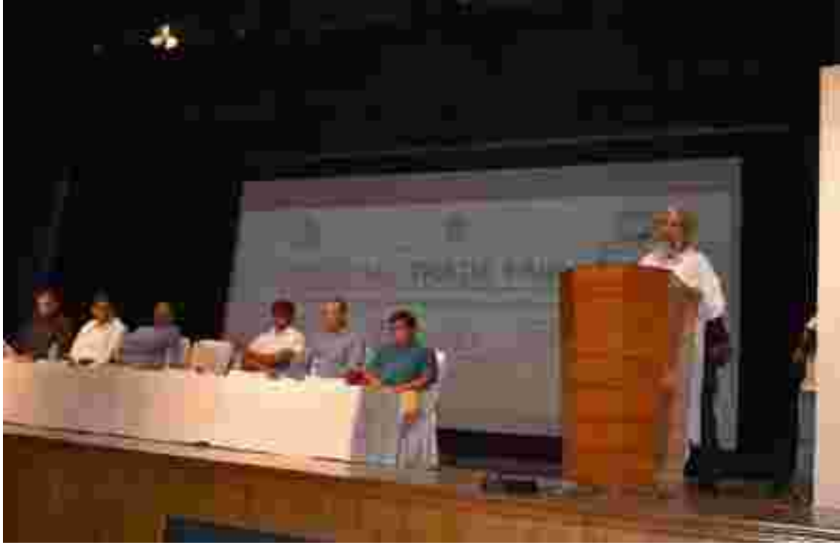
Sri Pratap Chandra Sarangi, Hon'ble Union Minister of state for MSMEs and Animal Husbandry, Dairying and Fisheries, Government of India addressing participants.