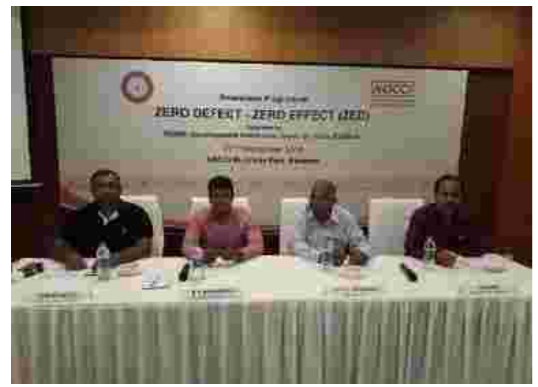
Dignitaries on the Dais during awareness programme on ZED held at Balasore.