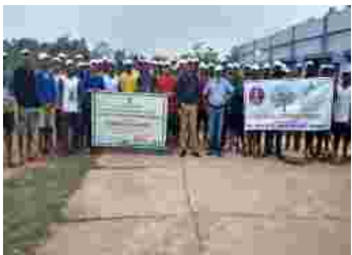
Swachhta pakhwada and cleanliness drive is being done at MSME-DI Branch office Rourkela.